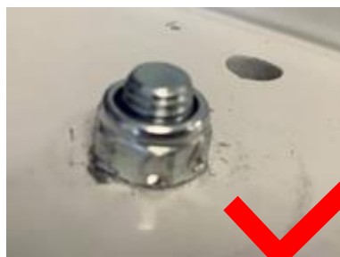
Figure 2 - conforming

Hillrom received an out of box complaint where it was discovered that the traverse carrier had been delivered with the incorrect, non-conforming screws. The length of the screws according to specification is M8X25 (25 mm) whilst the screws of the affected batch were M8X20 (20 mm). M8X20 does not lock against the nyloc nut when installed per the installation instructions, as per figure 2 (correct screw) and figure 3 (incorrect screw) below.