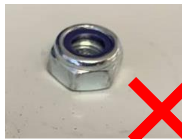
Figure 3 - non-conforming