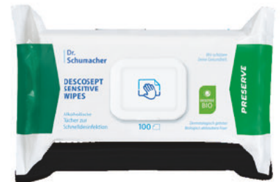
Packaging of the improved product.