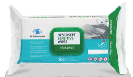
Packaging of the affected batch.