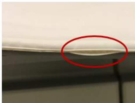
Figure 1 example of separated seam

WARNING: Use only coils, cables and accessories that are in good condition. Before using the coil, visually check each coil component, cable and accessory to ensure that there is no external damage. Visually check the coil for tears or damage to make sure no internal conductors are exposed. If any coil component, cable or accessory is suspected of not being in good condition, discontinue use and contact a GE Service Engineer.