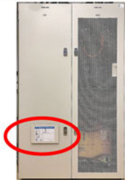
Figure 2: Front door of LCC