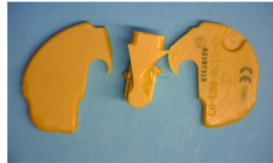
Fractured TASP top and bottoms

Based on the investigation results of these complaints, Zimmer determined that updates to device labeling associated with the Zimmer Persona Knee System were required to provide additional clarifications relating to the instructions for use of the TASP construct. Specifically, Zimmer has updated the Persona Surgical Technique (97-5026-001-00) and the Persona Constrained Posterior Stabilized (CPS) Surgical Technique (97-5026-072-00).