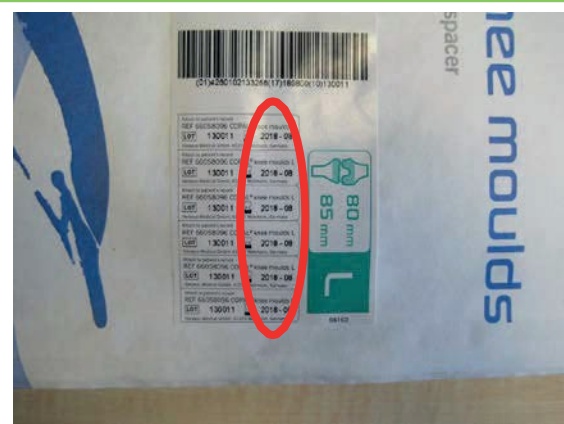
Patient sticker: correct expiry date

There is therefore no risk for users and patients who have already had COPAL® knee moulds used to create temporary knee spacers. There is also no risk for users and patients associated with using the COPAL® knee moulds up to the end of August 2018. After the correct expiry date of 08/2018 has elapsed, the COPAL® knee moulds must no longer be used.