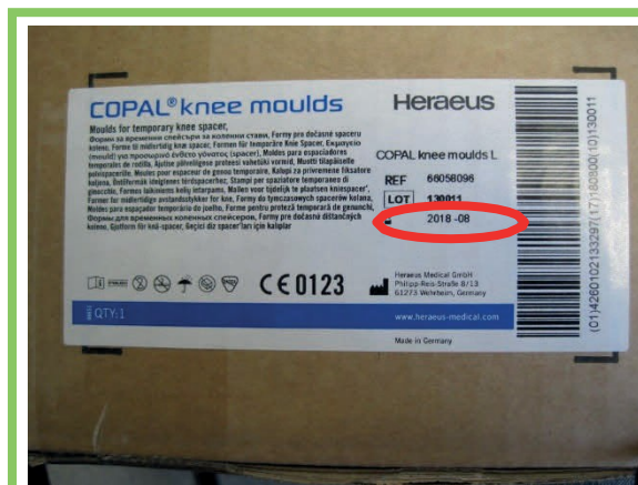
Outer carton: correct expiry date