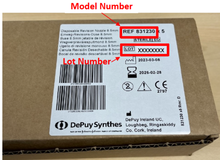
Figure 1: Example Product