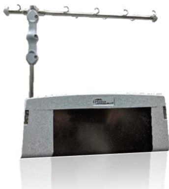
Figure 1: Photo of the IV pole collar installed on the Trima Accel IV pole.

If the operator does not hold onto the IV pole while pressing the IV pole release button, the IV pole may drop in a free fall. If the operator's hand or any other body part is in the path of the free-falling IV pole, the operator could be injured. Because this is an added safety feature, do not remove the collars after they are installed on the IV pole.