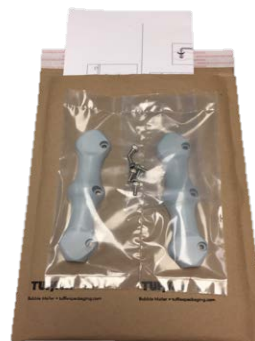
Figure 2: Photo of the IV pole collar prior to installation.

Your local Terumo BCT representatives will work with you to ensure IV pole collars are provided and installed on Trima Accel systems already in the field. On new machines, service technicians will attach the IV pole collar to the IV pole during installation.