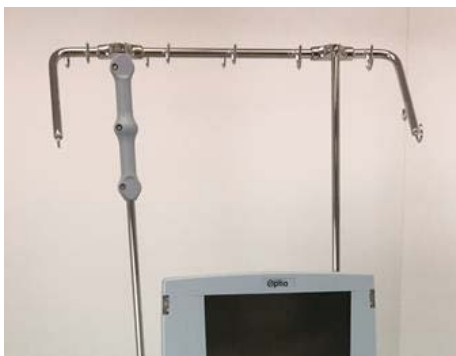
Figure 1: Photo of the IV pole collar installed on the Spectra Optia IV pole.

If the operator does not hold onto the IV pole while pressing the IV pole release button, the IV pole may drop in a free fall. If the operator's hand or any other body part is in the path of the free-falling IV pole, the operator could be injured. Because this is an added safety feature, do not remove the collars after they are installed on the IV pole.