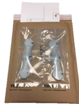
Figure 2: Photo of the IV pole collar prior to installation.

Your local Terumo BCT representatives will work with you to ensure IV pole collars are provided and installed on Spectra Optia systems already in the field. On new machines, service technicians will attach the IV pole collar to the IV pole during installation.