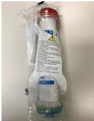
Figure 1: MICROPLAS Plasmafilter with warning label

Based on our investigations, there was no device malfunction. Both the incidents resulted from a user error where a plasmafilter was inadvertently used for treatment rather than the intended hemofilter. At the time of the reported complaints the product contained a warning placard. (Refer to Figures 1 and 2 below).