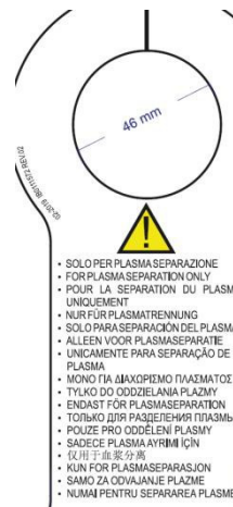
Figure 2: Closeup of warning label

A plasmafilter is used for the extracorporeal separation of plasma from whole blood when disease mediators that are acutely toxic are present. Plasma filtration for the purposes of toxin removal followed by a return of replacement solution is a procedure performed on acutely ill patients in the intensive care setting.