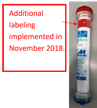
Figure 3: MICROPLAS plasmafilter

Medtronic is requesting that users be observant of the differences between a plasmafilter and a hemofilter.