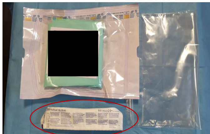
Representation of the possible non-compliant product in the configuration step