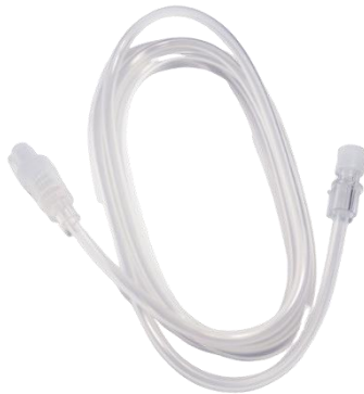
Figure 1: product image

Reference: PN-MDX3515M – Guerbet Part Number: 240004 Description: 150CM EXT/INJ LINE STRAIGHT CT/MR Lot Number: cf annex