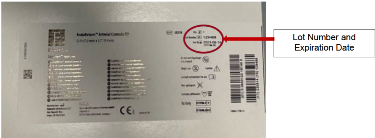
Figure 1 Example of where to find the EndoReturn Kit Label Lot Number and Expiration Date

The expiration date on the external kit box is the only information impacted. All other information is correct. While the expiration date on the kit box is incorrect, all items in the kit with expiration dates are correctly labeled. Therefore, the error is easily detectable before the product is used if the expiration dates for each component are verified prior to use.