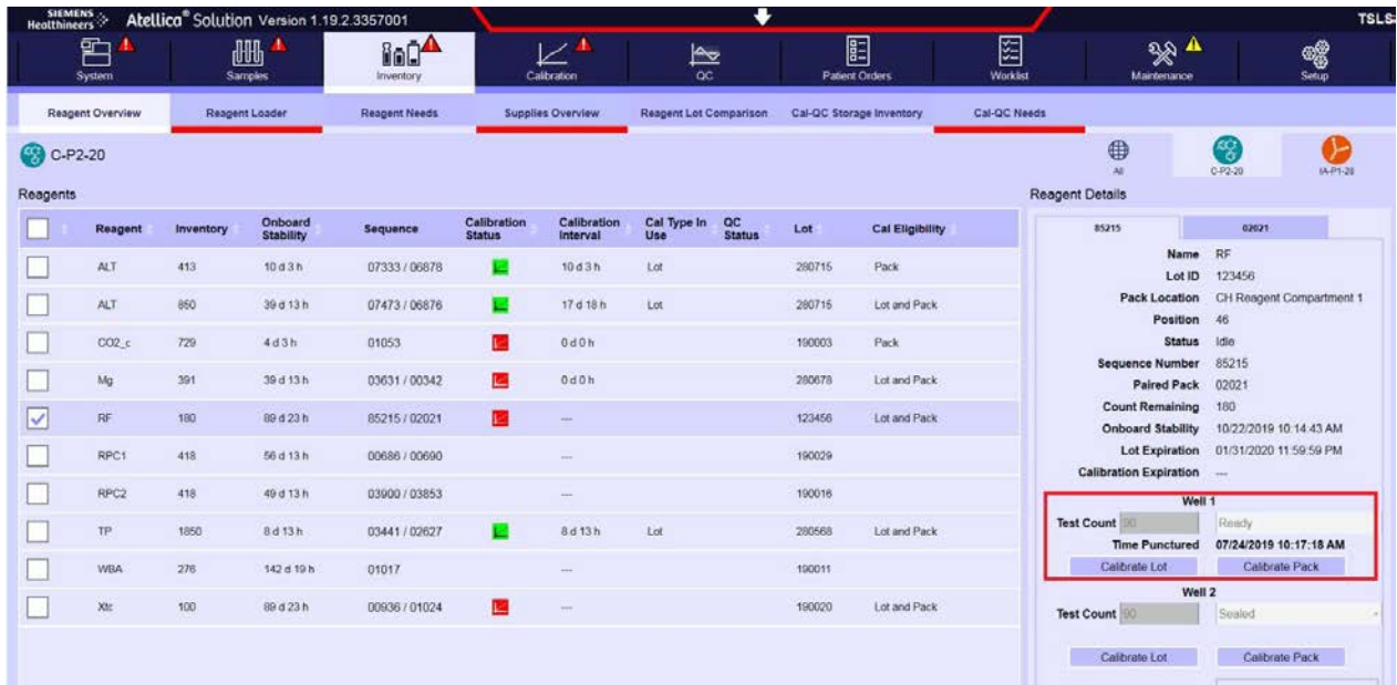
Figure 2. Reagent Overview Screen