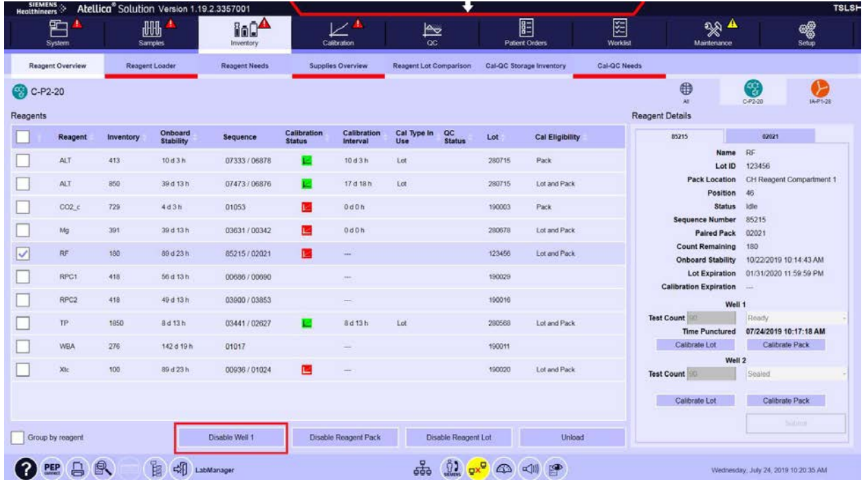
Figure 3. Reagent Overview Screen