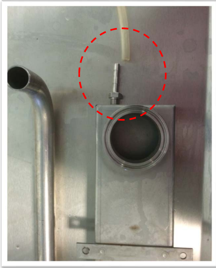
Figure 1: vent hole added on top of manifold to prevent trapping of air.

Appendix 1: Photos of ventilation hole eliminating any trapped air in the manifold..