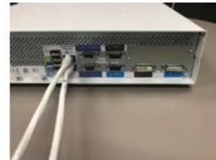
Figure 3: B850