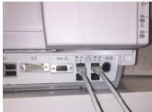
Figure 2: B650