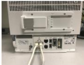
Figure 1: B450