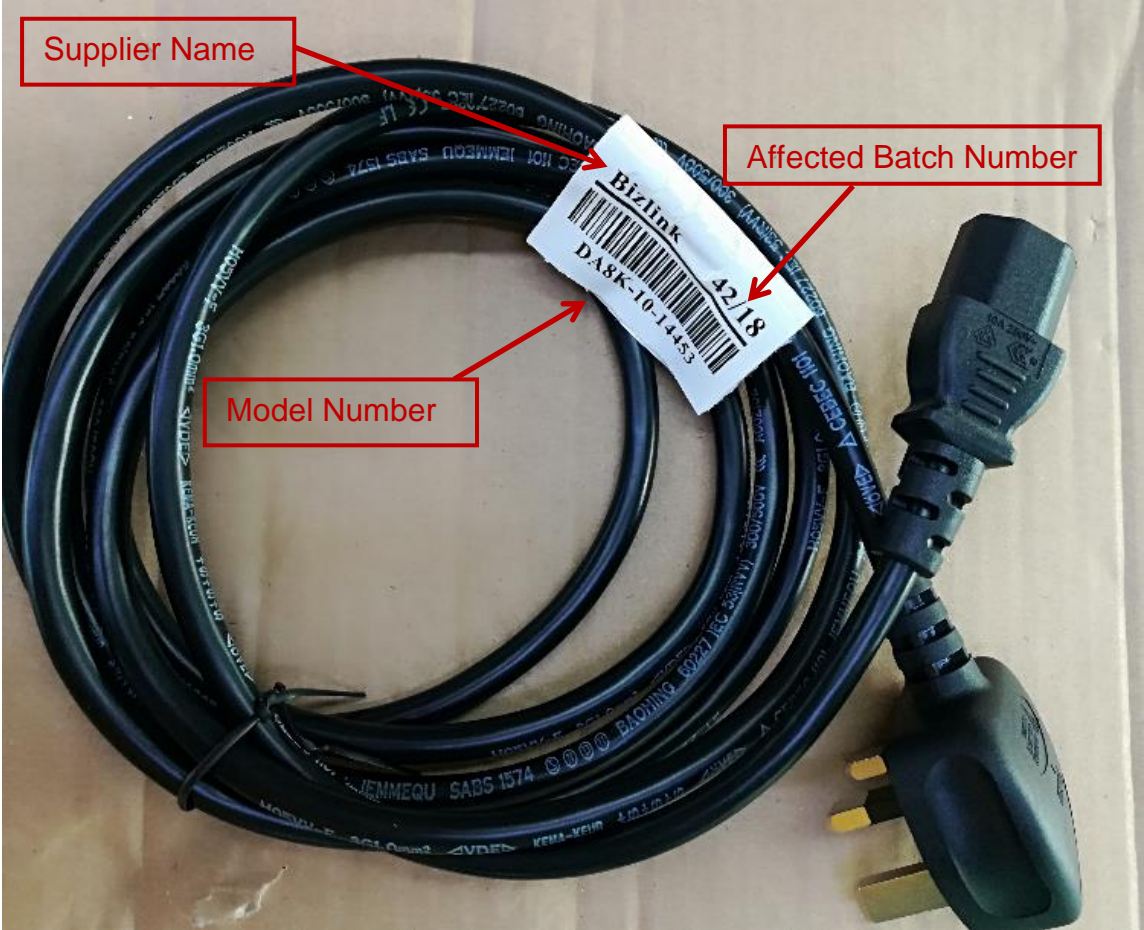
Figure 1 The information on the label

The label attached to the power cord contains the supplier name , model number and the batch number. Please refer to below pictures: