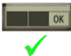
Figure 2 Device ready to use

If the status display shows "OK", the units can continue to be used (fig. 2). If the spanner symbol is displayed in the status display, however, the devices may no longer be used (fig. 3).