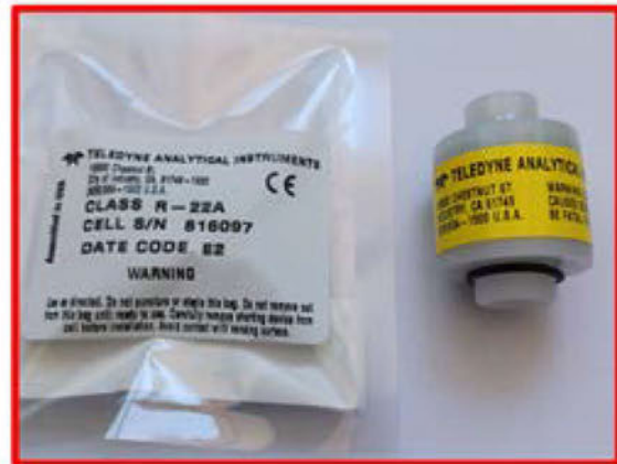
Needs to be returned!

We have internally performed the calibration with the R-22A sensor in the service software as well as in the user software. Both calibrations were passed. Even when measuring different O 2 concentrations, the normative limit value of \pm(2,5\% + 2,5\% of GAS LEVEL) according ISO 80601-2-55 was maintained at all measuring points. The R-22A sensor works in all devices HAMILTON-G5/S1/GALILEO/RAPHAEL like the R-22MED.