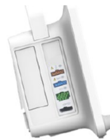
B1x5P without E-module slot option