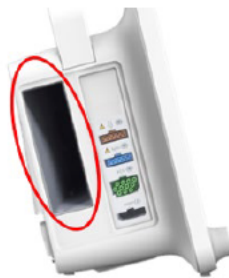
B1x5P with E-module slot option, and B1x5M