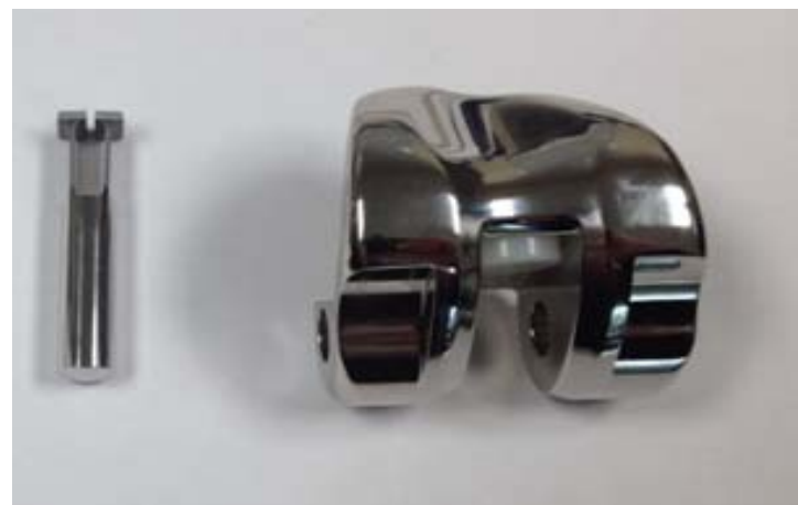
Figure 1: S-ROM® Noiles Rotating Hinge Femur with Pin

S-ROM Noiles Rotating Hinge Femur with Pin devices without packaging breaches may continue to be used to avoid temporarily causing a sudden and complete lack of product availability and the bone loss associated with removing a well-fixed MBT Revision Tibial Tray.