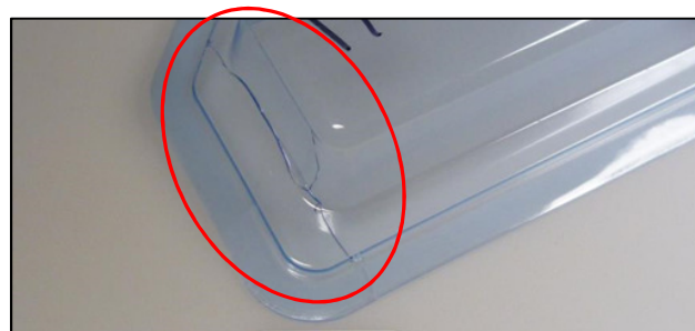
Fig. 2 Outer tray damage