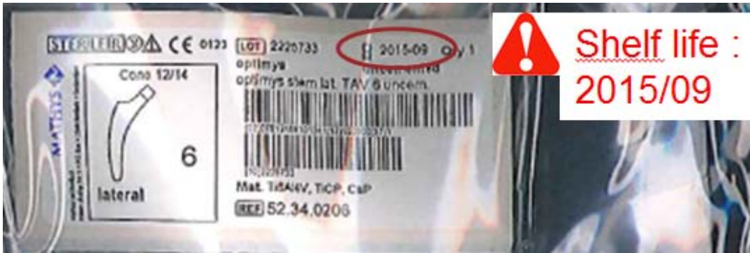
Figure 1: Example of the incorrect patient labels inside the packaging