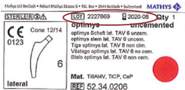
Figure 2: Example of the correct label on the cardboard box