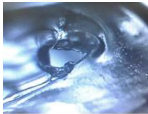
Inner Tray Hole 6X magnification