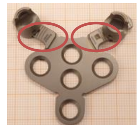
Fig. 1: OCCIPUT plate – batch 52433451

Due to the deviation from the product specification, an intraoperative exchange of the affected plate may become necessary and lead to an extension of the surgical time. The manufacturer recommends having four different sizes on the set, which should generally provide a replacement plate.