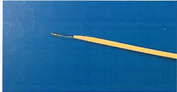
Figure 3 – Coil Missing

A device that has a coil on to the delivery pusher may be used. A device that is missing its implant coil should not be used. A replacement device should be obtained and presence of the coil confirmed per IFU. If the verification steps are not performed per IFU, the user may potentially advance the delivery system without an implant into the peripheral vasculature. Testing shows that the stiffness of the delivery pusher stiffness is not higher than that of regular intravascular guidewire. As a result, the company has concluded that the likelihood of patient harm is improbable.