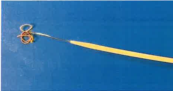
Figure 2 – Coil Present

If you follow the pre-deployment instructions during the preparation of the product, you will see whether there is an implant coil present at the end of the delivery pusher. A delivery pusher with an implant coil should look like figure 2 (below) and a delivery pusher that is missing the implant coil will look like figure 3 (below).