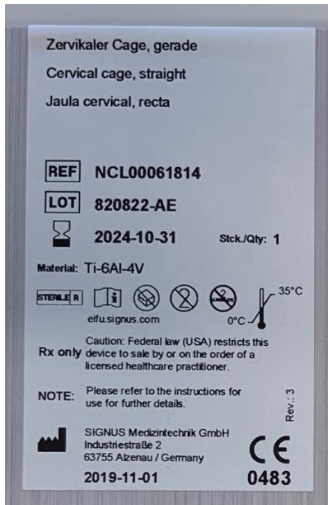
Figure 1: Label Outer carton 0°

The product JASPIS ST and the only affected article number and batch can be clearly identified by the product identification. Figure 1 and 2 show the label of the outer carton: