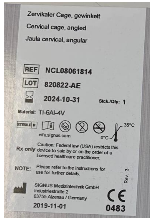
Figure 2 : Label outer carton 8°