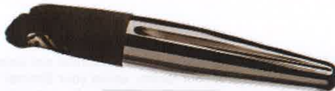
T.E.S.S stem prosthesis

Please refer to Attachment 2- Potentially affected Product List for the full list of lot numbers.