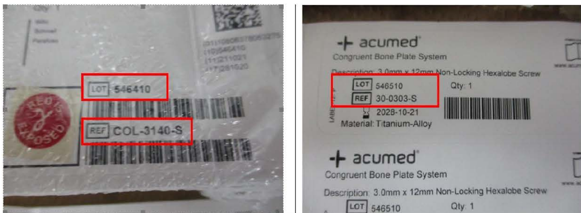
Figure 1. The part number (REF) and batch/lot number on the outer box (left) does not match the part number and batch/lot number listed on the medical chart label (right) found inside the box.

Figure 1 below illustrates an example of a product with the outer box labeled as part number COL-3140-S batch/lot 546410 that contains a medical chart label with part number 30-0303-S batch/lot number 546510 listed on the label.