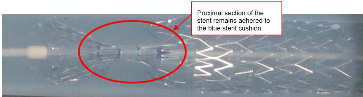
Figure 1: Proximal end of the stent remains connected to the stent cushion material