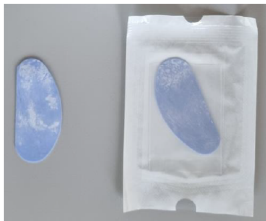
Figure 1. Image of nasal splint

Exmoor Plastics, the legal manufacturer of the Exmoor Plastics® range of single-use instruments, has been made aware of a potential manufacturing defect concerning the nasal splints produced by the company. Product coatings used in the production process have not been removed prior to packaging. The coating is an inert talc and we have had no reports of serious incidents from the field.