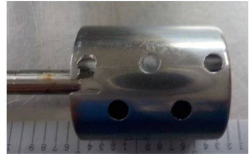
Figure 2: Compress Device Short Anchor Plug

Biomet Orthopedics LLC is conducting a batch/lot specific medical device Field Safety Corrective Action for the Compress Device Segmental Anchor Plug and the Compress Device Short Anchor Plug products listed in Attachment 2 – Affected Product List . The impacted anchor plugs potentially have metal burrs in the transverse holes of the device, preventing the drill or pins from passing through. The issue was determined to be caused by a manufacturing process update impacting select batches/lots manufactured prior to 2019. To date, there have been five complaints received for the issue.