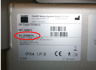
Type plate of operating table