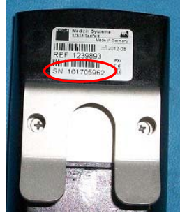
Type plate of remote control