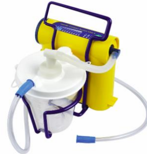
LCSU 4 800 ml (4.3 lbs) canister version