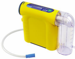
LCSU 4 300 ml (3.3 lbs) canister version

Important Note! This Urgent Safety Notice only applies to Laerdal Compact Suction Units 4 (LCSU 4) manufactured since 1 May 2015.