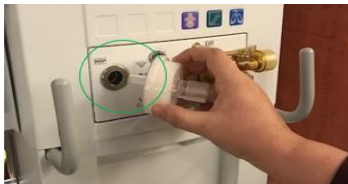
Figure 3: Ventilator Outlet Port with the ISG inlet connection

Note: The metal ventilator outlet port is correct.