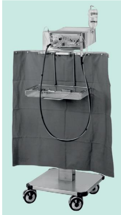
Figure 1: Disposable Fleece Drape GA414 attached to sterile shield GA419 on a mobile stand GA415 according to intended use

The scope of the affected articles can be limited to the Disposable Fleece Drape with the article number GA414. The Aesculap AG decided to recall the product as a precaution.