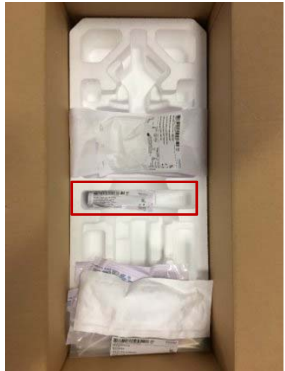
Figure 3: The rolled pouch that contains the tight caps in the Styrofoam inlay

The affected tight caps are packed in an individual sterile package placed outside the VKMO/VHK. The tight caps are used to replace vented caps during vacuum assisted venous drainage (VAVD) procedures and post-operative vacuum-assisted wound drainage. These caps are required to be sterile in both applications as they are in contact with the blood path.