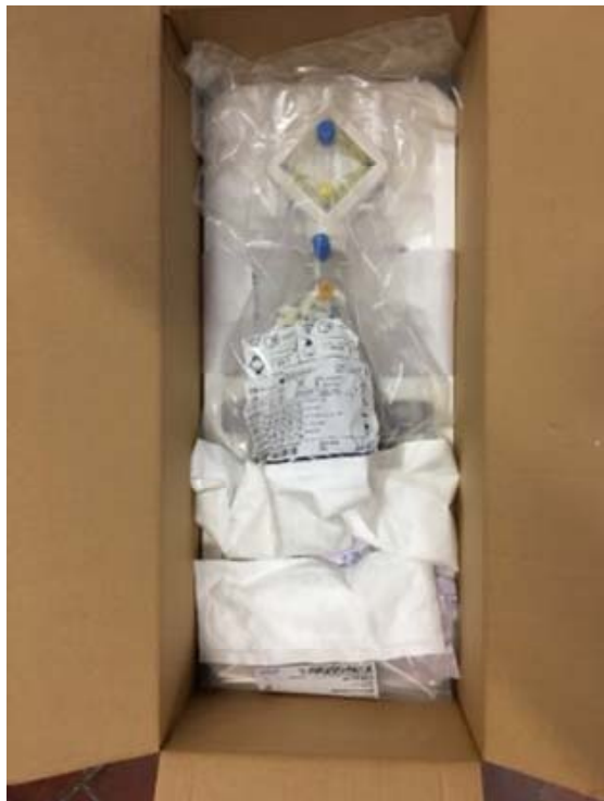
Figure 2: VKMO packed in Styrofoam inlay

Figure 2 and 3 show the VKMO and accessories placed in the Styrofoam inlay inside the cardboard box.