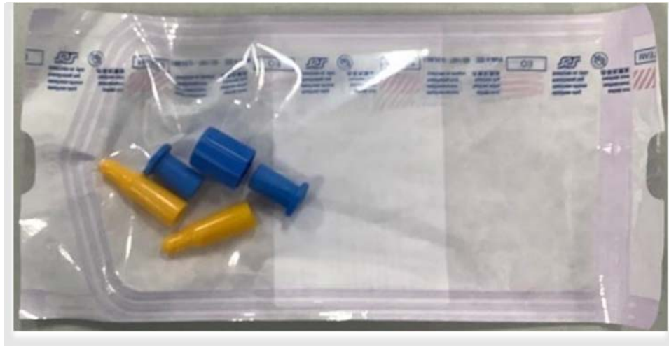
Figure 1: Sterile pouch that contains the tight caps.

Figure 2 and 3 show the VKMO and accessories placed in the Styrofoam inlay inside the cardboard box.