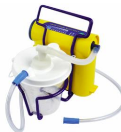
LCSU 4 300 ml (3.3 lbs) canister version LCSU 4 800 ml (4.3 lbs) canister version