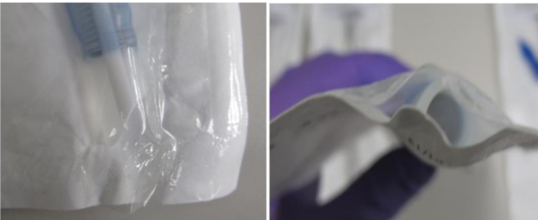
Figure 1. Photo of broken seal.

Smiths Medical became aware via field complaints that the bottom pouch seal of Bivona® Aire Cuff Wireless Endotracheal Tubes, was partially open allowing the tubes to protrude from the packaging compromising product sterility. See Figure 1 below for a depiction of this issue.