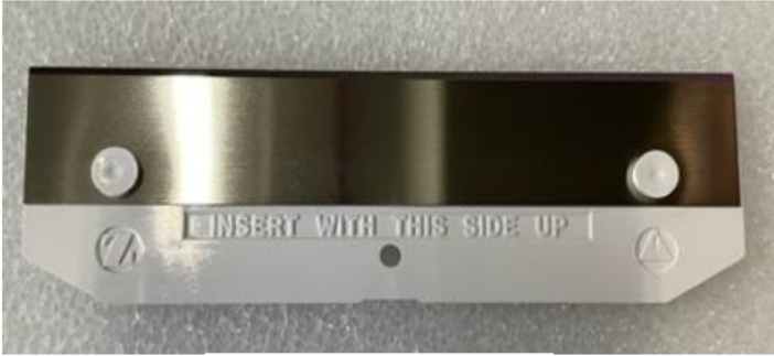
Figure 1 Dermatome Blade

Affected Product: Zimmer® Dermatome Blades (see Attachment 2 for the affected product list)