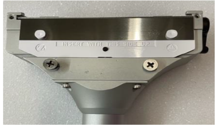
Figure 2 Dermatome Blade assembled in Dermatome Handpiece

Zimmer Surgical, Inc. is conducting a batch/lot specific medical device Field Safety Corrective Action for the Zimmer® Dermatome Blades listed in Attachment 2 – Affected Product List . There have been 38 complaints received related to skin grafts being thin and non-uniform when using the affected blades. The issue would be identified at the time of use and may result in the need for additional harvests to adequately cover the area. The trade-off of incomplete coverage versus having additional grafts is at the discretion of the health care provider based on the condition of the graft, overall patient condition, and severity of the need for the graft.