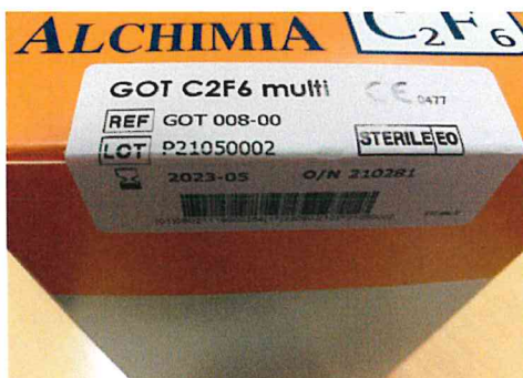
Figure n. 3

Photo of the gas cylinder in the blister tray of lot P21050002 of GOT 008-00 (back side)