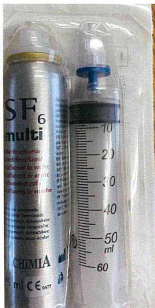
Figure n. 1

Photo of the gas cylinder in the blister tray of lot P21050002 of GOT 008-00 (front side)