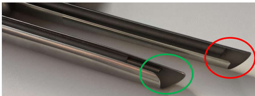
Figure 1: Former design green, current design red

KARL STORZ determined an increased incident rate for the 10973HD – Video Mediastinoscope. Four incident reports where a patient injury and sharp edges on the tip of the device was reported, were received. For the predicate device no incident reports of this nature were received. Compared to the predicate device, the current device has a changed design on the device tip, see Figure 1. As the tip is chamfered according to specification, the issue was therefore found to be design related.