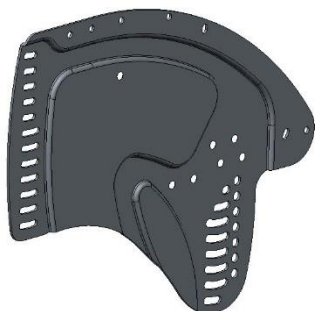
pic. 3 Standard side guards