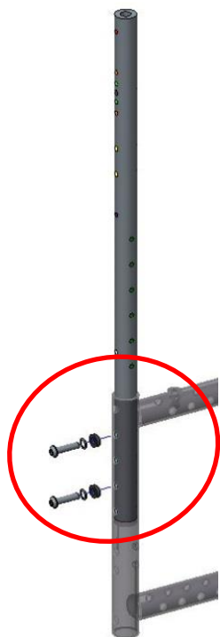
pic.5 back tubes with screws