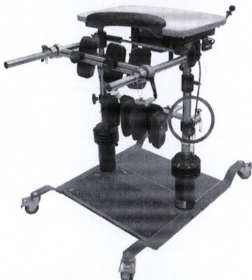
Picture: THERA-Trainer balo

The hexagon socket set screw of the mounting mechanism of the knee support is broken.