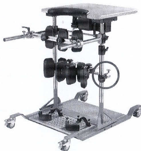
Picture: THERA-Trainer verto