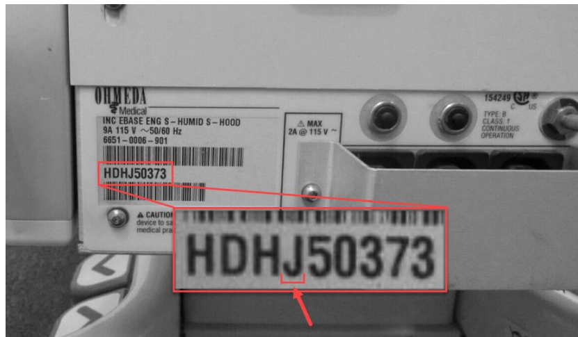
Figure 1: Serial number label, 4 th letter location