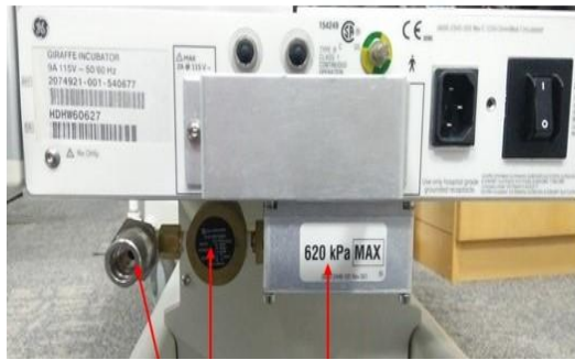
Figure 2: Servo Oxygen module is installed