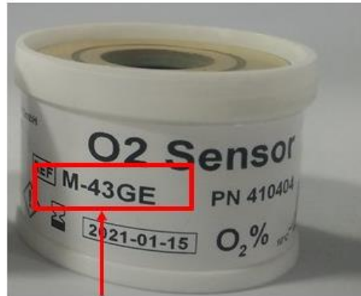
Figure 5: Oxygen sensor part number: 6600-1278-600 Figure 6: Oxygen sensor part number: M-43GE