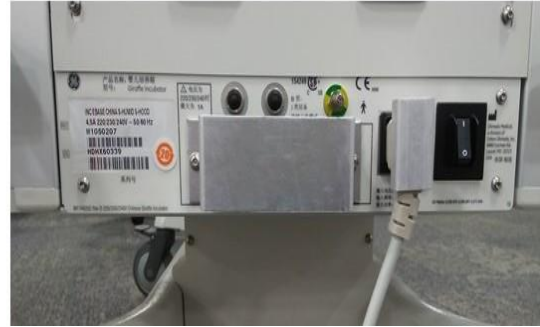
Figure 3: Servo Oxygen module is NOT installed