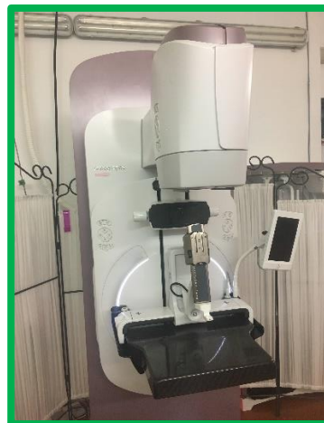
Figure #1 – Acceptable Gantry Position for Biopsy Procedure: Senographe Pristina gantry rotation angle is 0°. Vertical approach setup.