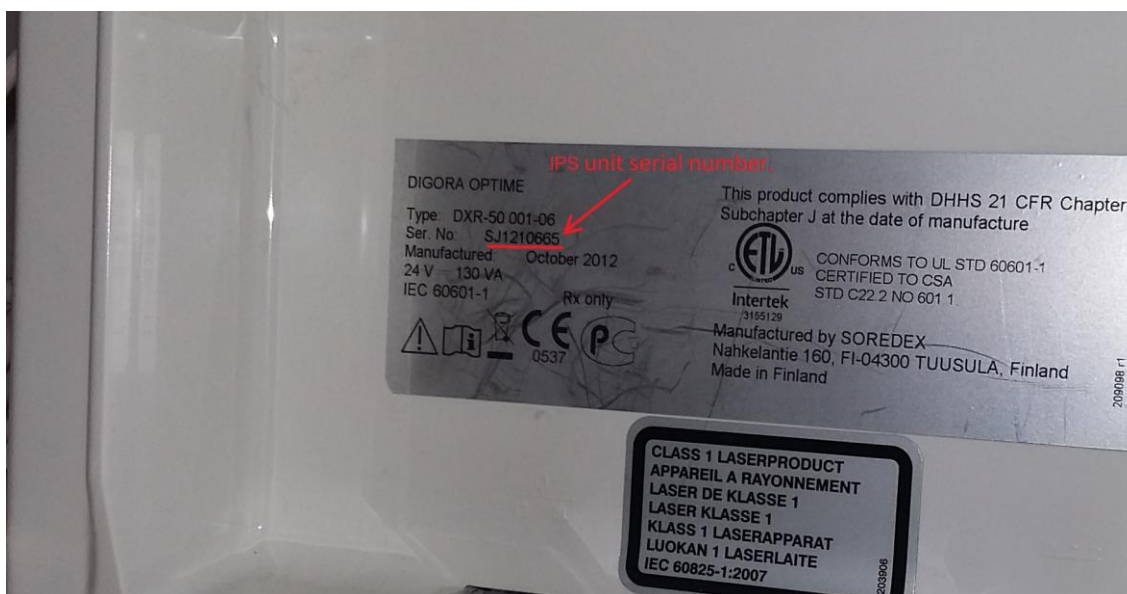
Picture 1: The serial number of the IPS unit is located on its type label at the back of the unit.

The affected IPS unit can be identified by looking at the serial number on the scanner display or the type label at the back of the unit as shown in Picture 1.