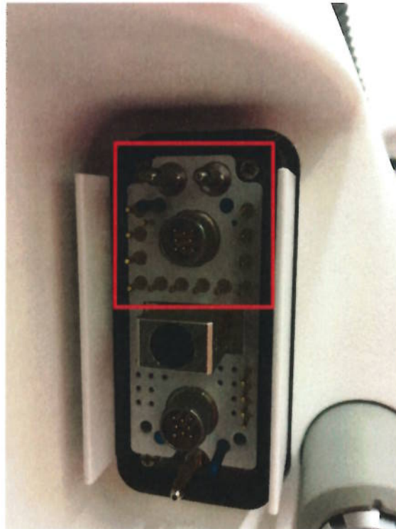
figure 2: example of X10 connector contact pin area which must not be touched