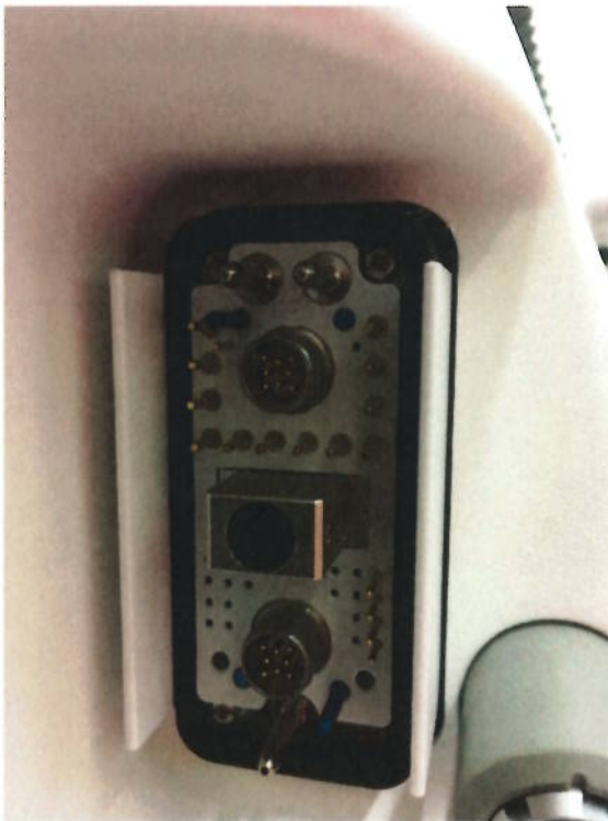
figure 3: example of X10 connector without the plug of the main cable being plugged in