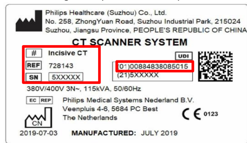
Figure 1. System Label Example