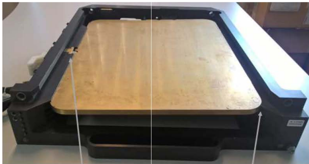
Locking pin activated